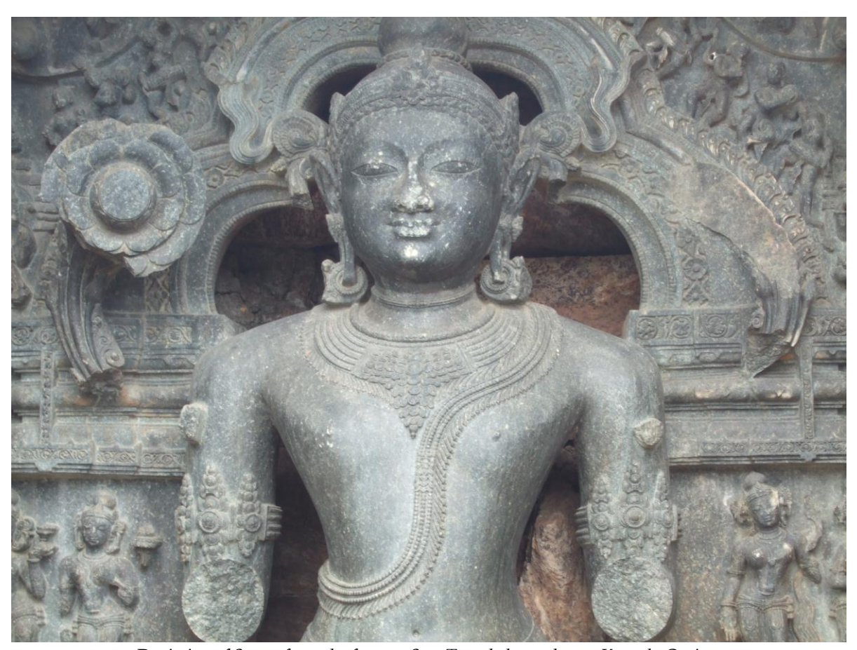
Depiction of Surya from the famous Sun Temple located near Konark, Orrissa