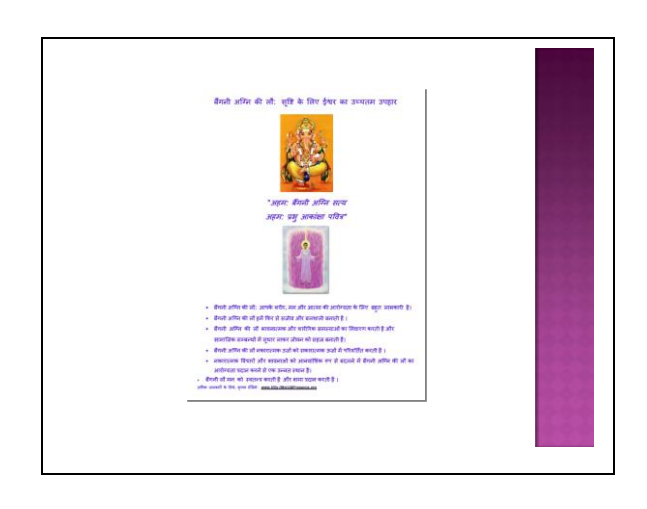
A flier on the violet flame in Hindi: "Violet Flame: Supreme Gift of God to Mankind."