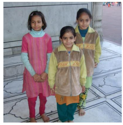
Children in New Delhi The bottom line is that the population of India is young, dynamic, educated, and becoming upwardly

mobile, with growing families and often two working parents. Many traditional Hindu leaders lament the loss of spiritual values to materialistic goals.