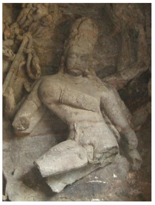
Shiva in the cave temple of Elephanta Island Near Mumbai