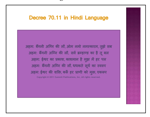
Decree 70.11 has been translated into Hindi.